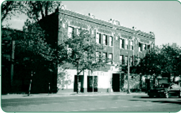
Vacant commercial building on East Jefferson slated for redevelopment